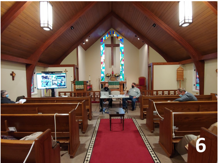
1. Pentecost—High School grads celebrate. 2. Trunk or Treat. 3. Cleaning the altar for Sunday. 4. Altar Guild polishing brass. 5. Blessing of the animals. 6. Annual Meeting held in January, 2021.