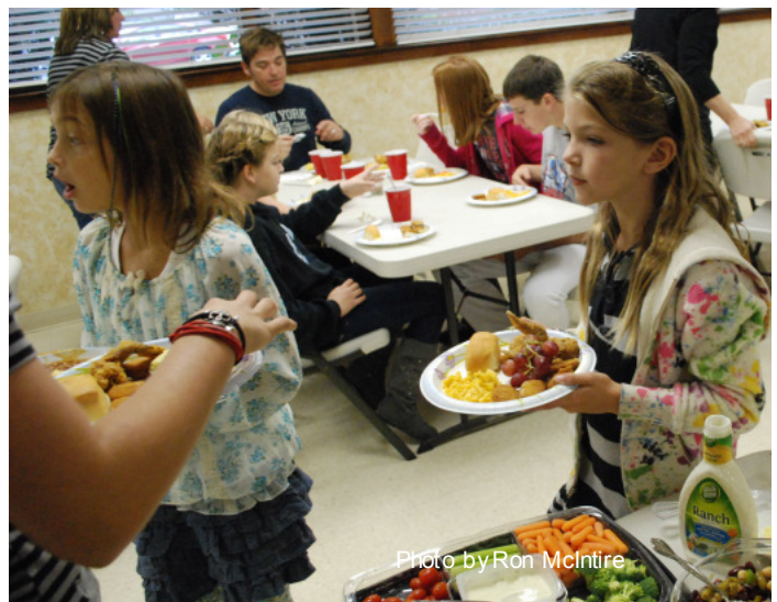
Finding a seat was hard to do at the parish Rally Day Chicken Dinner September 18, 2011.

We meet in the undercroft and use Synthesis CE (copies available) as a guide to our exploration and discussion. This one-hour investment of time is guaranteed to inform, enrich, and inspire.